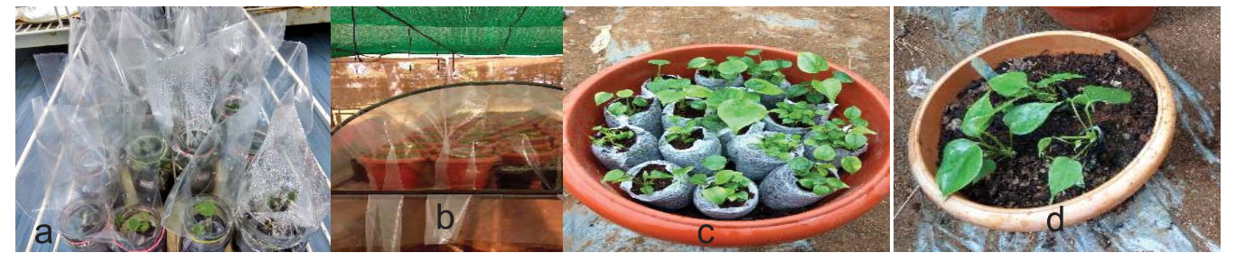
Fig 2. Acclimatization of micropropagated Anthurium plants. (a) Plants acclimatized under artificial light and room temperature in growth chamber for 30 d - primary hardening (b) Secondary hardening plants in humidity chamber of green house (c) plants after 60 d of secondary hardening (d) plants in potting mixture after 90 days of potting.