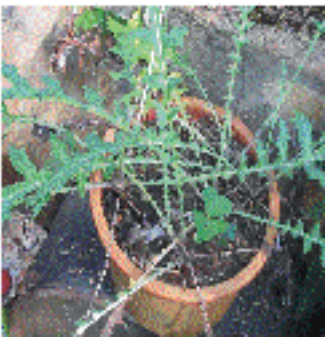
Fig. 3. 8-month-old seedlings under nursery; and 8-month-old seedlings under glasshouse conditions.

facilitate the incorporation of pathogens, which caused seed contamination during in vitro germination. It is well known that many tropical species grow with pubescent hairs, which allows the penetration of pathogens into plant tissues that cause contamination. In this study, unsterilized seeds (control) cultured in vitro were completely begun to be contaminated before the emergence of radicle, three days after seed sowing. It is known that the conditions in vitro which favour target seed germination (plant growth), i.e. high levels of nutrients, humidity and warm temperatures, also favour the growth of micro-organisms which multiply and grow rapidly affecting the germination potential (Bewley and Black, 1994; Khana, 2003). Thus, contaminants affect plant growth /seed germination potential by growing on media, consequently reducing the pH below 3, metabolizing much of the nutrients (carbohydrate), and ultimately producing phytotoxic fermentation products such as ethanol and acetic acid (Bewley and Black, 1994; Khana, 2003). This action starve the carbohydrate of the plant tissue, make certain nutrients unavailable, and ultimately causes toxic effects through the production of secondary metabolites like phenol oxidates (Bewley and Black, 1994; Khana, 2003). However, sterilized seeds of E. kebericho with 10% sodium hypochlorite and 70% ethanol for five and nine minutes, respectively highly reduced the growth of fungi, and consequently best germination was achieved (Table 1).