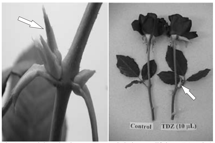
Fig. 1. Lateral shoot development (arrowed) during vase life in cut 'Memoire' (left photograph) and 'First Red' (right photograph) roses pulse-treated with 10~\mu L~L^{-1}TDZ .

as dichloroisocyanuric acid (DICA) (Joyce et al. , 2000) Vase life was assessed daily. Each replicate was 5 individual stems of each cultivar for control and TDZ treatments. A completely randomised design was adopted, and t-tests (Minitab Release 13.1) were used for data analysis for each cultivar.