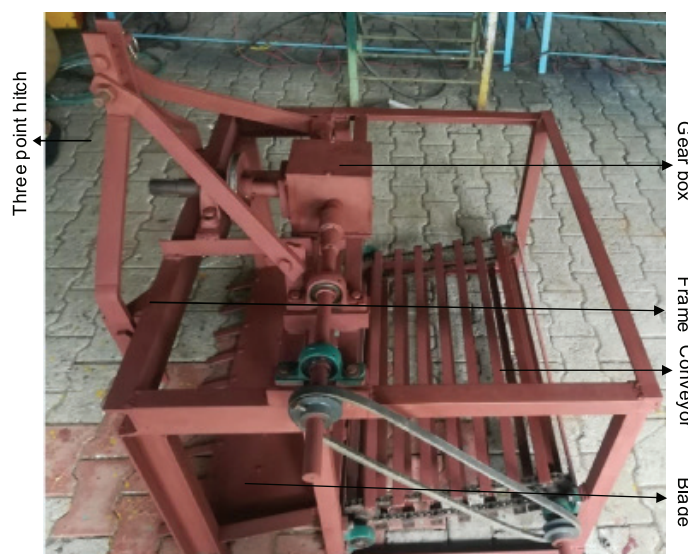
Fig. 3. Developed mini-tractor operated turmeric harvester and mother rhizomes, respectively and it was found that the roundness of fresh finger and mother rhizomes were 0.3065 and 0.5244, respectively. Sphericity of the fresh finger and mother rhizomes was 0.3052 and 0.4312, respectively. The cylindricity of fresh finger and mother rhizomes were found to be 0.7604 and 0.6428, respectively. As both finger and mother rhizomes cylindricity values were higher than roundness and sphericity values, the shape of the fresh finger and mother rhizomes can be considered as cylinder for all practical purposes.

Shape: The shape of turmeric finger and mother rhizomes in terms of roundness, sphericity and cylindricity were measured at a moisture content of 384.56 and 228.60 % (db) for fresh finger