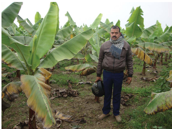
Outbreak of banana Fusarium wilt caused by Foc TR-4 in Bihar