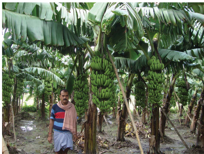
The same field after implementation of ICAR-FUSICONT technology

Assessment of the social status of the adopters and non-adopters (Table 4) with regard to age, land holding and educational status revealed that about 46.67 and 60.00 % adopters were in the age group of 30 to 40 years in U.P. and Bihar, respectively. Average land holding analysis showed that about 86.67 % of adopters in U. P. were having less than one ha while in Bihar about 76.67 % of adopters were with the land holding of more than one ha. We also observed that about 60 to 73.3% of the adopters were having education status of secondary level and above. Our study on social status showed that most of the farmers in the affected region of U.P. where small to marginal while in Bihar most of the banana cultivators of the disease affected zone were small to large farmers. Farm size was considered as one of the significant factor influencing the adoption of organic farming technologies (Adebayo et al. , 2013). Education status played a major role in adoption of the technology. Youths in the